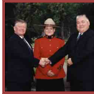
Protocol and Memorandum of Understanding on Cooperation and Communication Official Signing Ceremony July 16, 2002

The purpose of the forum is to build relationships with First Nations and share mutual concerns. The participants were from Lheidli T'enneh Band, McLeod Lake Indian Band, City of Prince George and Regional District elected officials and staff. The main highlight of the forum was the signing of a protocol on communications and cooperation between Lheidli T'enneh and the Regional District, which was a first in the province. In February, the protocol agreement received a prestigious award from the Fraser Basin Council on